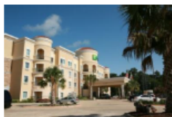
Holiday Inn Express & Suites 4404 S. First Street, Lufkin 936.699.3000

$99/Night King or Double Queen Standard $109/Night King Suite