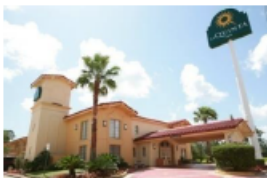
La Quinta Inn 2119 S. First Street, Lufkin 936.634.3351

$70/Night for Double Queen $65/Night for King Standard