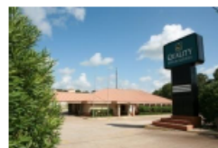
Quality Inn & Suites 4306 S. First St., Lufkin 936.639.3333

$70/Night for Double Queen $65/Night for King Standard