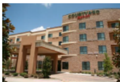
Courtyard Marriott 2130 S. First St, Lufkin 936.632.0777

$109/Night King or Double Queen Standard $119/Night King Suite