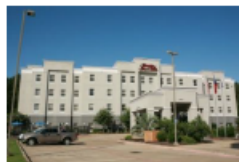
Hampton Inn & Suites 4400 S. First Street, Lufkin 936.699.2500

$89.99/Night Standard King or Double Queen