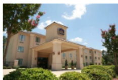
Best Western PLUS Crown Colony Inn & Suites 3211 S. First Street, Lufkin 936.634.3481

$89.99/Night Standard King or Double Queen